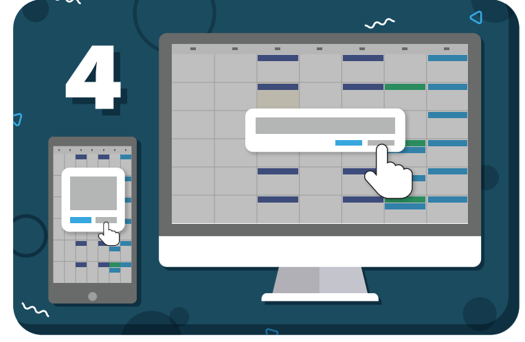
Follow the on-screen instructions to complete the sync

Have more questions? Check out the Help Center by clicking ? in the top right corner