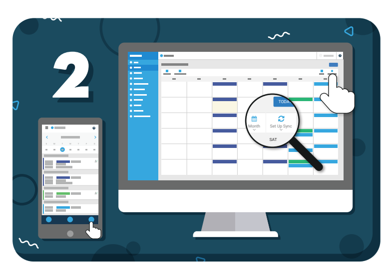
Click "Set Up Sync" in the toolbar