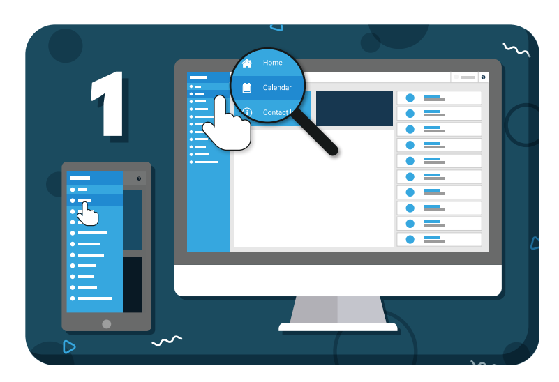
Navigate to "Calendar" from the main menu on the left